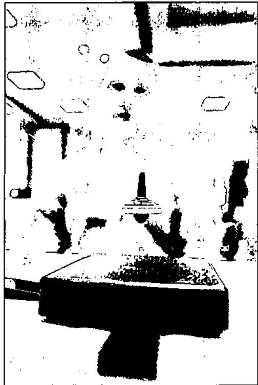
UFO top floats, but will it fly?