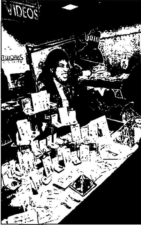
Inside the vendors' room.