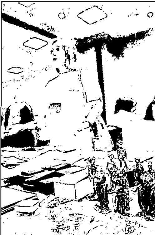
Gloria Wingfield at the crop circle table.